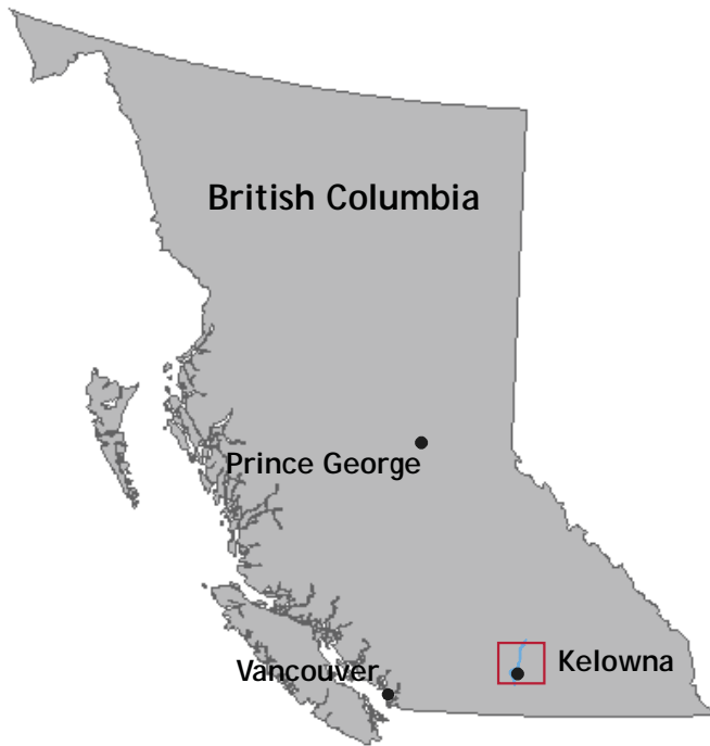
2006 Census Data (Statistics Canada)